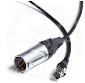
XLR5 Male Plug

It is the standard model made just a bit better. You may have seen this style headset on a camera operator. Dalcomm adds the comfort of your choice of ear seals, an improved microphone, and earphones for an exceptionally pleasant experience.